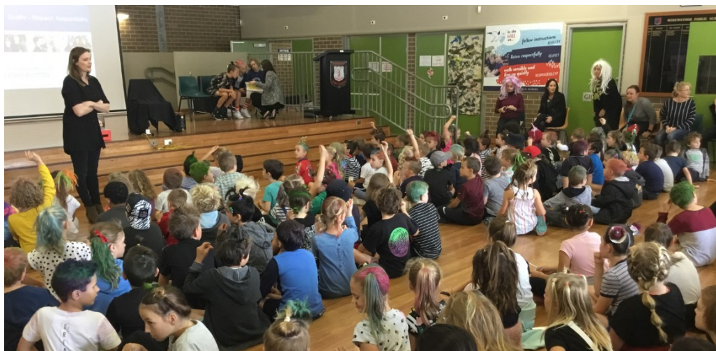
Crazy Hair Day