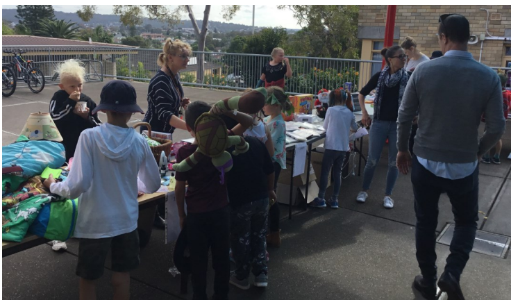
Trash and Treasure