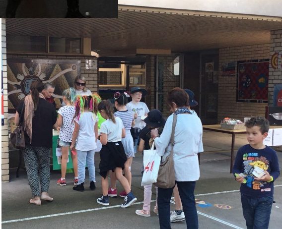
Lining up for Yoghurtland