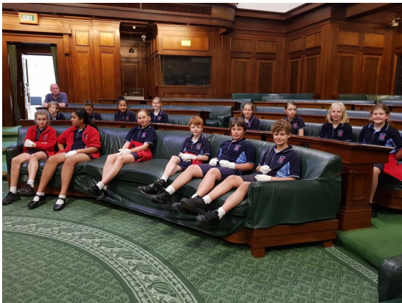
Old Parliament House

The Australian Government recognises the importance of all young Australians being able to visit the national capital as part of their Civics and Citizenship education. To assist families meet the cost of the excursion the Australian Government contributed funding of $20 per student under the Parliament and Civics Education Rebate program towards those costs. The rebate is paid directly to the school upon completion of the excursion.