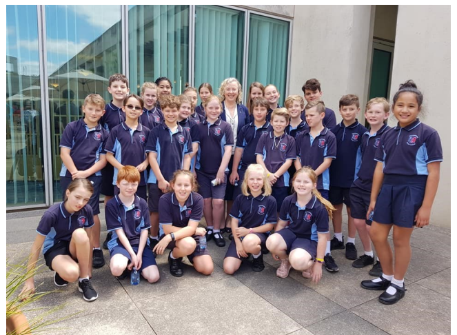
Meeting with Sharon Claydon, the Federal Member for Newcastle