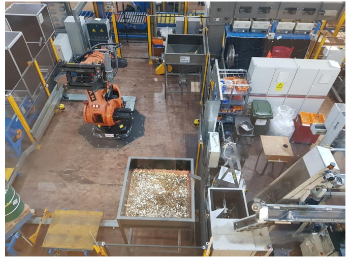
Watching 'Titan' robot produce coins.