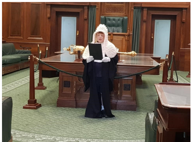
Ben B in the House of Representatives.