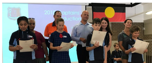
Taking the Oath. Our captains for 2018